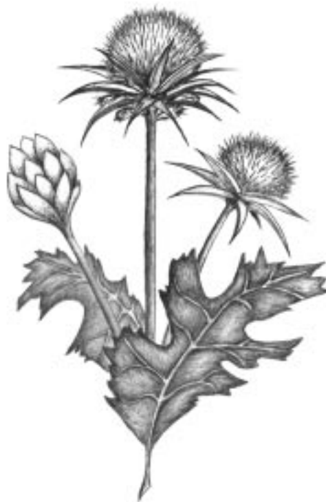
Figure 1. Milk Thistle

The active constituents of milk thistle are flavonolignans including silybin, silydianin, and silychristine, collectively known as silymarin. Silybin (Figure 2) is the component with the greatest degree of biological activity, and milk thistle extracts are usually standardized to contain 70-80 percent silybin. Silymarin is found in the entire plant but is concentrated in the fruit and seeds. Silybum seeds also contain betaine (a proven hepatoprotector) and essential fatty acids, which may contribute to silymarin's anti-inflammatory effect.