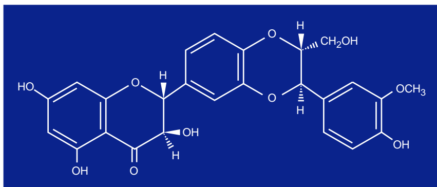
Figure 2. Silybin

one series of 18 patients treated with silymarin, all patients survived except one particularly high-dose suicide. The authors concluded, "Administration of silymarin even up to 48 hours after mushroom ingestion appears to be an effective measure to prevent severe liver damage in Amanita phalloides poisoning." 8 In a 1995 study of